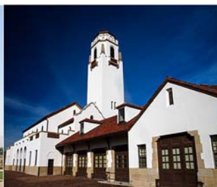
Historic Boise Train Depot