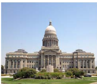
Boise State Capitol