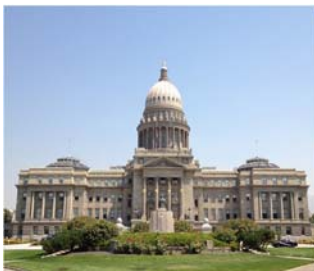
Boise State Capitol